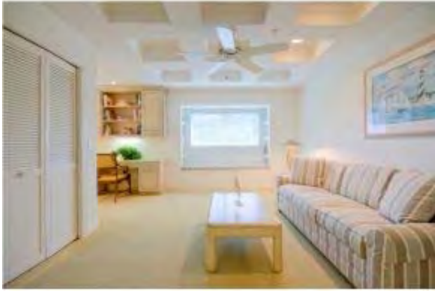
Upper Level Den