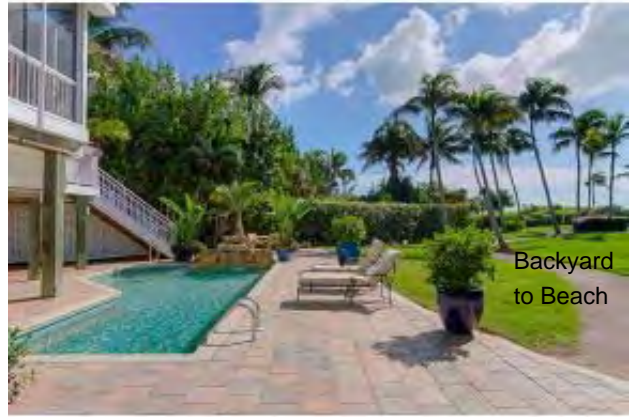
Backyard to Beach

- - - Information herein deemed reliable but not guaranteed - - -