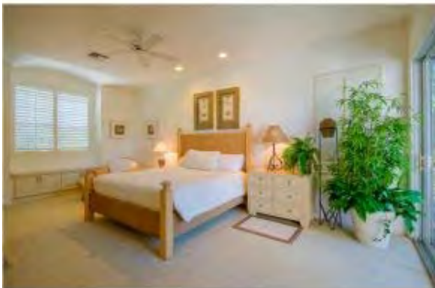
Guest Bedroom 2