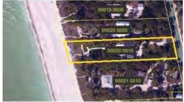
Aerial View of Property

- - - Information herein deemed reliable but not guaranteed - - -