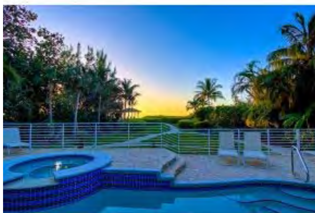
Beach Side - Pool Area