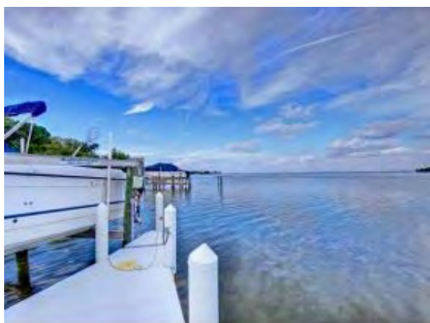
Dock & Bay