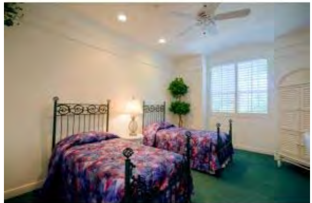
Guest Bedroom 3