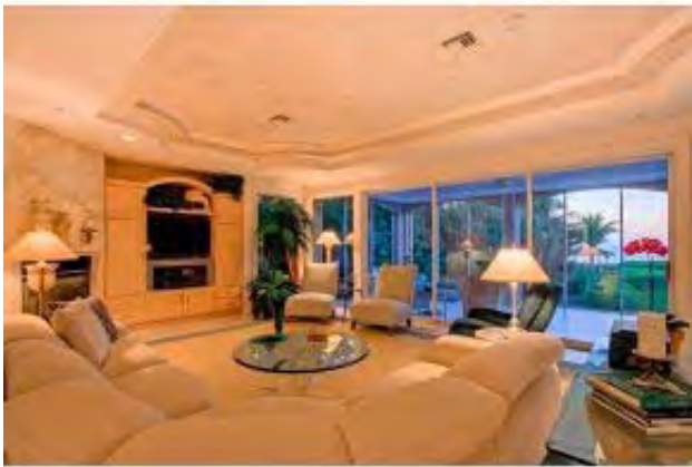
Living with a view!