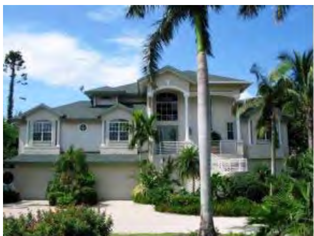
Front of home