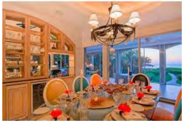
Dining & Wet Bar