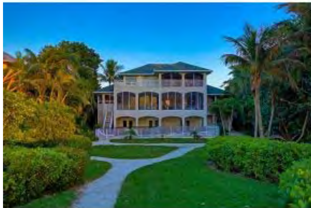
Gulf side of home