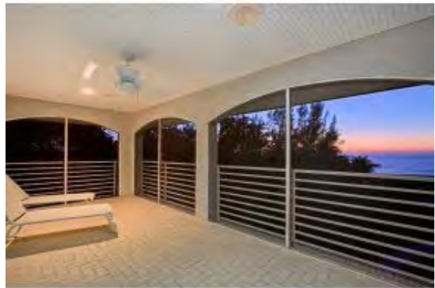
Veranda off Master

- - - Information herein deemed reliable but not guaranteed - - -