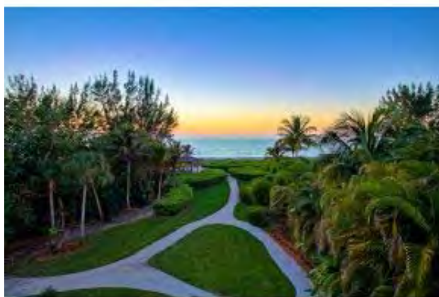
Path to Beach

--- Information herein deemed reliable but not guaranteed ---