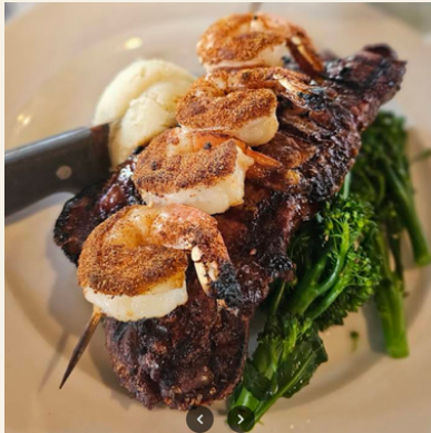
Rumrunners – upscale seafood & steaks on the water