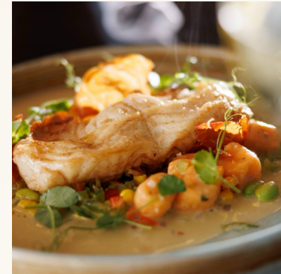
Gather – creative New American at the Tarpon Point marina