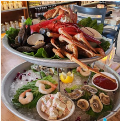
Lobster Lady – seafood market & bistro