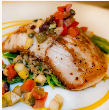
Tarpon Lodge – historic waterfront inn