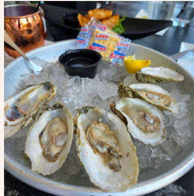
Fish Tale Grill – fresh catches, raw bar