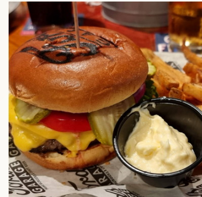
Ford's Garage – Burgers & American food